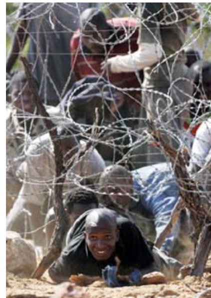
Zimbabweans leaving their own country.

car, but making her innocent years safe and happy. Give her the gift of a white school.